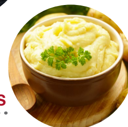
MASHED YUKON GOLDEN POTATOES