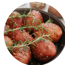
GRILLED RED POTATOES