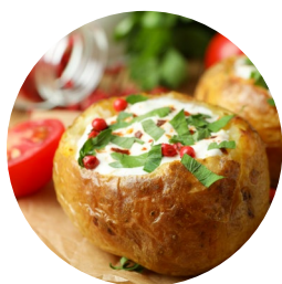
BAKED RUSSET POTATOES