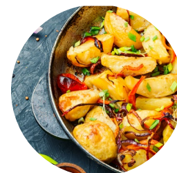
SKILLET SAUTEED POTATOES