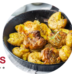
ROASTED FINGERLING POTATOES