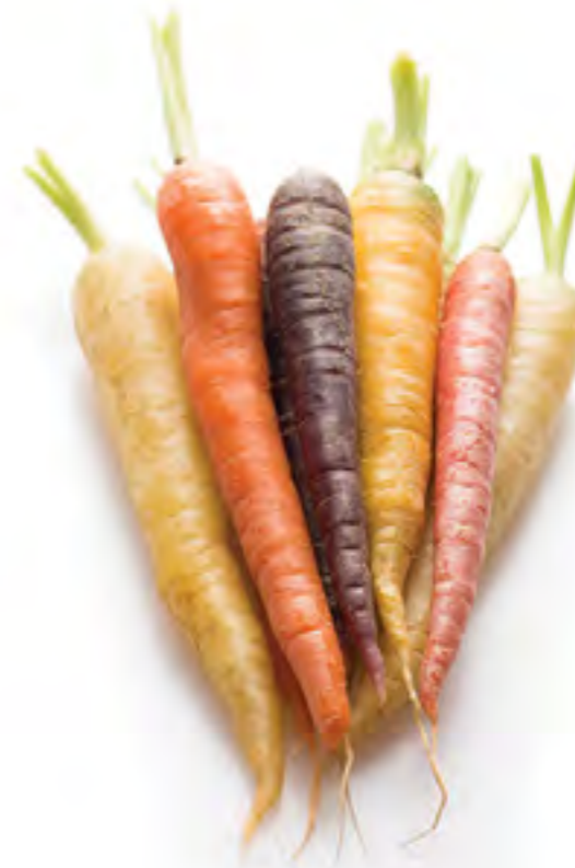
ELEVATE THE HUMBLE