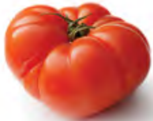
PICO DE GALLO