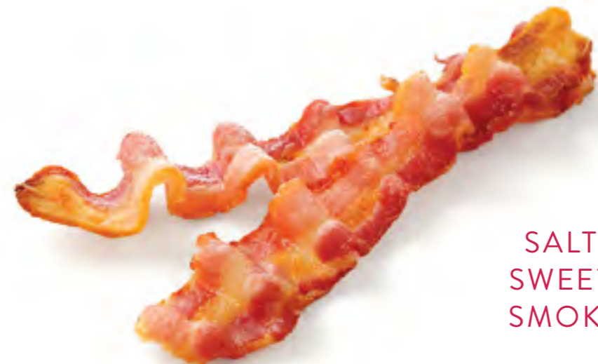
SALT, SWEET, SMOKE