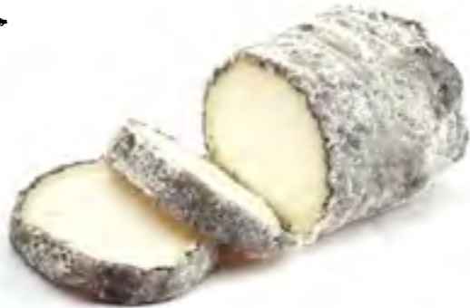
BEET-GOAT CHEESE SALAD