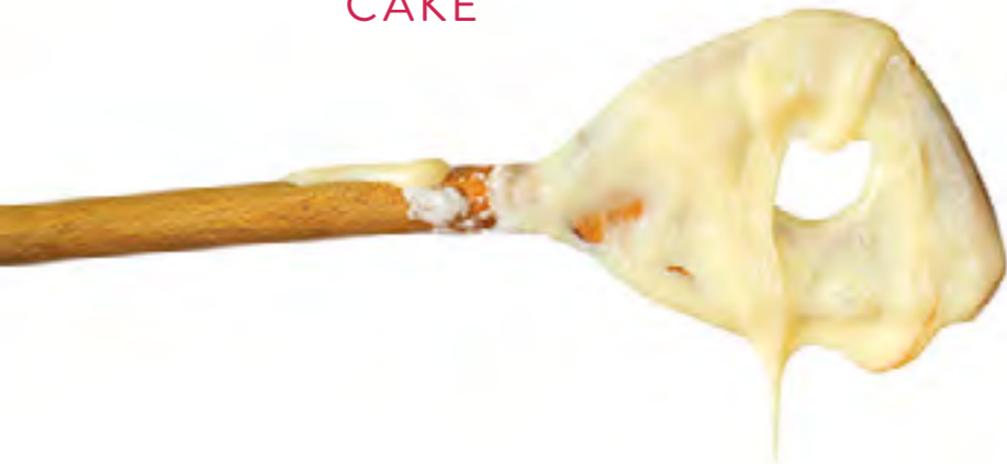
UPSIDE DOWN CAKE