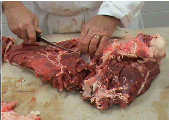
Top shoulder taken off the blade, separating Flat Iron, Petite Tender (Lazar Steak, my favorite steak) and the Ranch Steaks