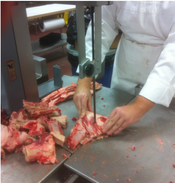
Cutting bones using proper technique