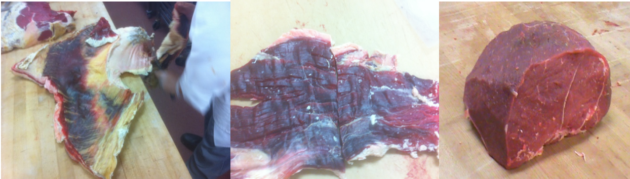
Flap meat from the Loin Flank steak, trimmed off skin Trimmed Sirloin tip

The last picture is a sirloin tip Roast, dry cooking methods recommended. The next and last primal was the loin, the most flavorful piece of meat. We decided to bone it out and taste the Beef tenderloin and compare it to the Top Loin steaks (New York Strip) and both were boneless.