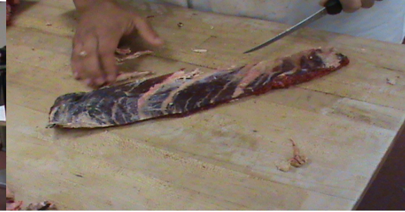
Figure 2 skirt steak trimmed

We fabricated the front part of the steer, which is the chuck/rib section. The first piece of meat we took off was the skirts steaks. The skirts steak skin was dried out from aging but it looked nicely marbled and it tasted was very tender and flavorful not chewy or bland.