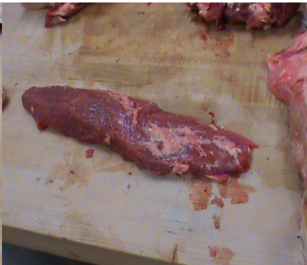
Bottom Round was small from the round