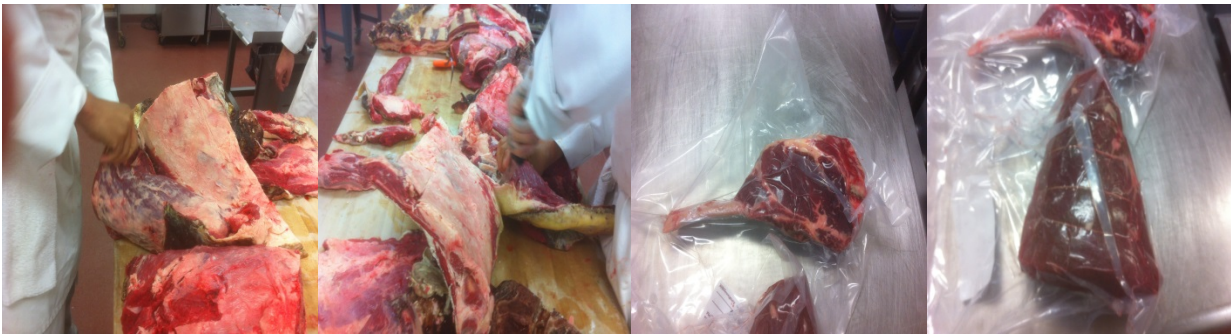
Action shots: Boning out the Brisket from the breast plate bone. Cowboy Rib Steak and Top Round Roast tied up and packaged.