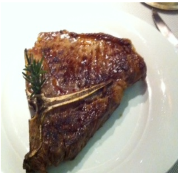
Finally, grass-fed Porterhouse Steak – delicious!!!