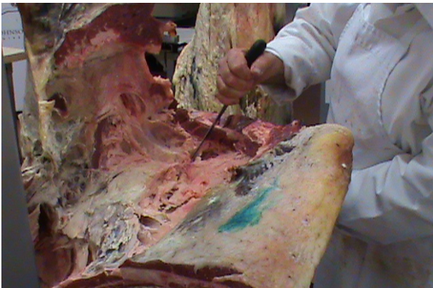
Separating the Brisket of beef from the chuck

The side of beef has 13 rib bones. There are five on the chuck, seven on the rib and the lucky 13 th on the loin. It is an industry standard method. We separate the chuck and rib by counting down the five rib bones and separating it with a knife cut then sawing it. The chuck swings a little, which is why they use to call it swinging beef. It is made up of the neck and shoulder meat which is separated by a blade bone. The shoulder contains the Petite Tender (Lazar Steak), the Flat Iron and the Ranch cut besides other muscles that we will use for stew or chopped meat. We also take off the Brisket (Pot Roast, Corned Beef or Texas Style Barbq) and one of the students boned it out or took the meat off the bone.