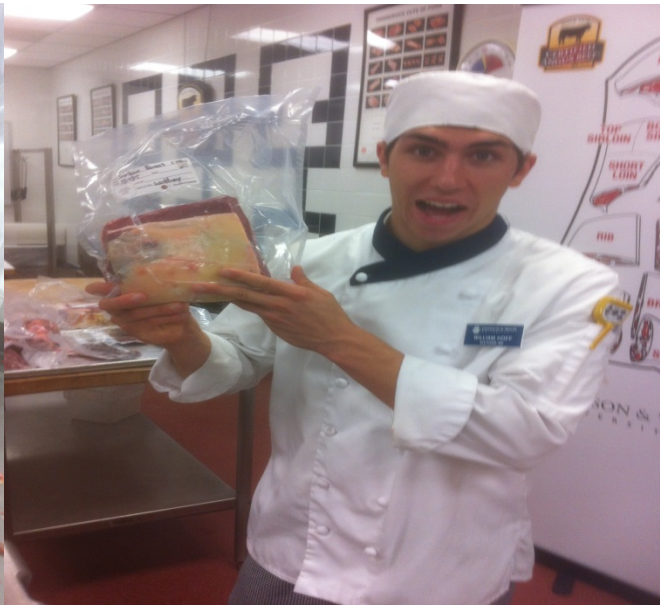
Student displaying proper packaging and labeling