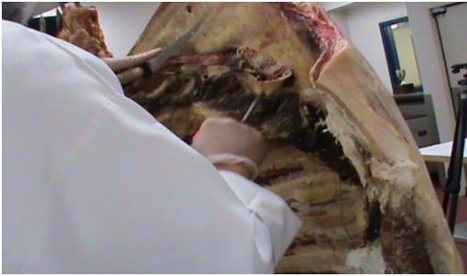
Figure 1 Taking the skirt steak off